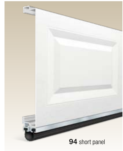
94 short panel